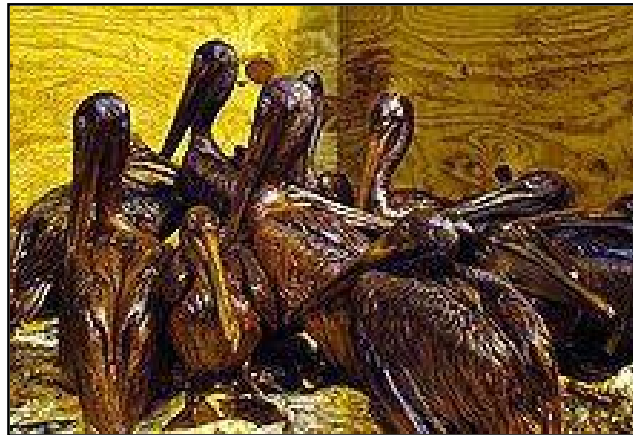
Oiled pelicans following the BP Gulf disaster

Even after dozens of witnesses, a hundred hours of testimony and three months of investigation, a chairman of a federal panel exploring the Deepwater Horizon disaster admitted Wednesday that he still lacked a simple