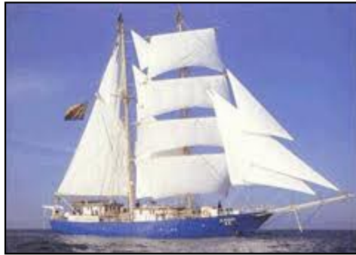
Project Kaisei ship sails toward for the Pacific Gyre.

"Marine debris is one of the greatest pollution problems we face, and the North Pacific Gyre has captured media attention and the public imagination,"