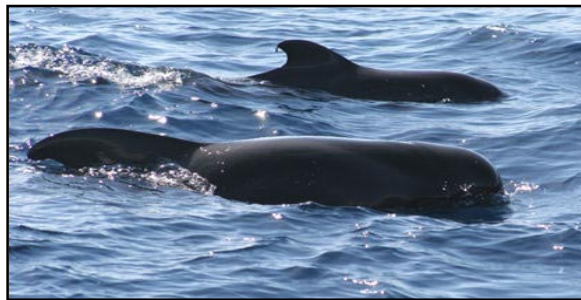
Pilot whale photo from the internet – photographer unknown

stranded on the same beach. New Zealand DOC spokesperson Sioux Campbell said there was no explanation for why mass strandings were common on New Zealand shores.